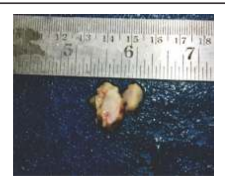
Fig. 1: Cut Section of the Swelling showing Pale White Areas